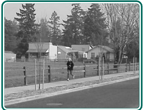
Lewelling residents recently planted trees at their Neighborhood Park.

ments and lots of information all packed into an hour. Also make sure you read the Island Station article. They are making strides and need support to remove the sewer treatment plant.