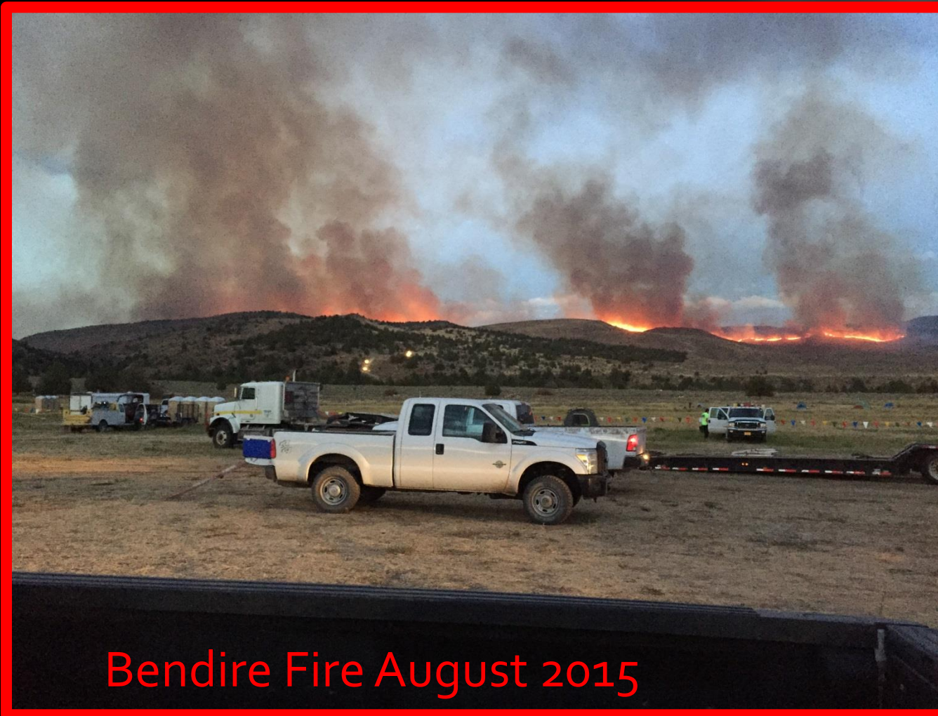
Bendire Fire August 2015