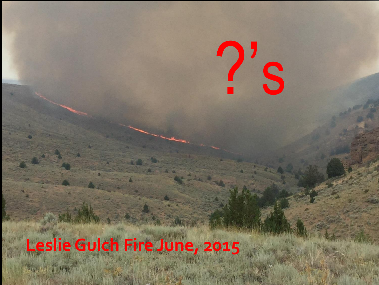
Leslie Gulch Fire June, 2015