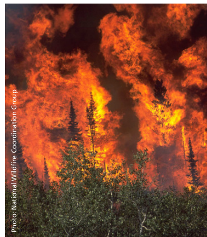
Devastating crown fires put firefighters and communities at risk.