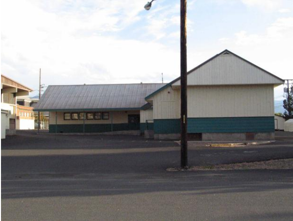
Bates Building, bright colors and old paint.