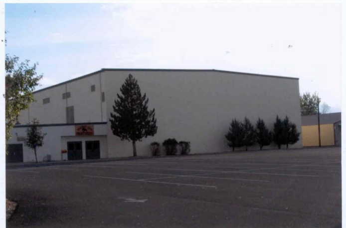
Elementary School and old gym.