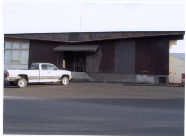
High School Addition, faded, old paint.

After researching paint methods the team chose to write a grant for the cost of the Professional Contractor to do the prep work, priming and painting on hard to reach or difficult to paint areas on the buildings. It made sense to try this first because volunteers without adequate training would not know how to prep correctly and it would jeopardize the sustainability of the paint.